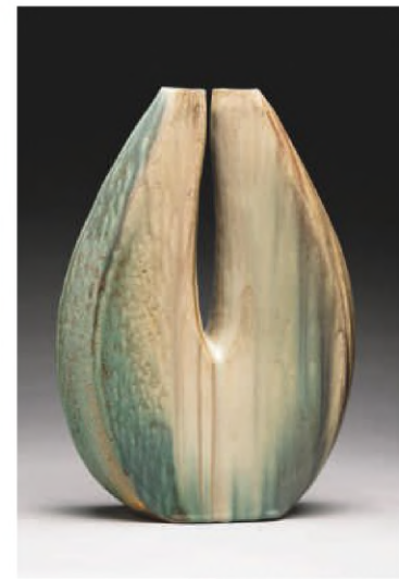
LISA BATTLE/STUDIO GALLERY