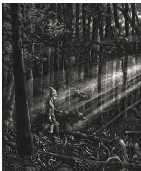
LOST ORIGINS GALLERY

Adam Pendleton's "Not Against the Memories," one of three screen prints.