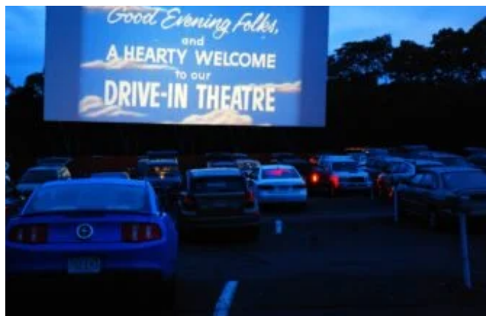
The Drive-In Movie Theater in Alexandria Is Starting Its Season This Friday