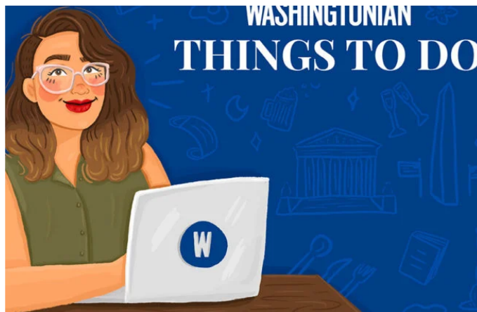
New Theater, Jazz, and a Beer-and-Pizza Fest: Things to Do in DC, February 25-28

© 2021 Washingtonian Media Inc. All Rights Reserved.