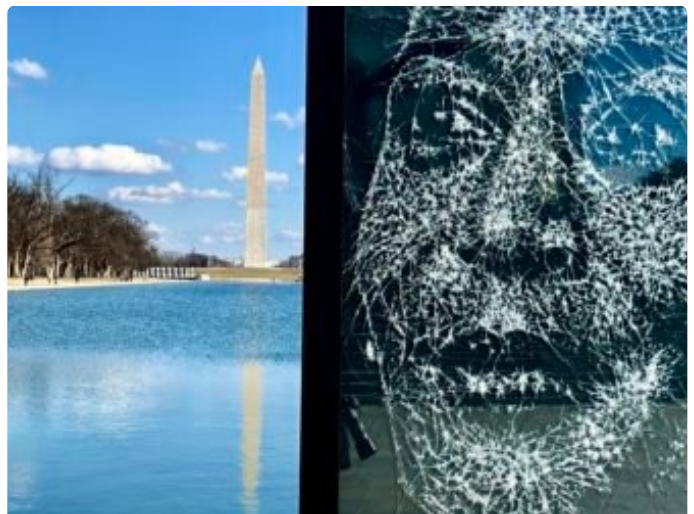
Glenstone Will Reopen Its Grounds on March 4